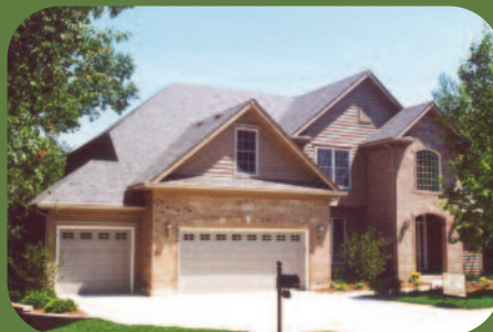
“The Monico” First Floor Master Suite