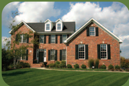
“The Virginia” First Floor Master Suite

Tall Oaks & Highland Woods - Far West Side of Elgin, 301 School District